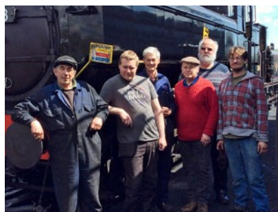
Boiler Washout & Examination attendees

The course can be tailored from novice to expert over 2 to 4 days and gives hands on training with distance learning, a practical assessment by an independent assessor completing with a short exam. The skills acquired can be used for the fabrication of heritage pressure vessels and structures.