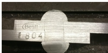
Approved test piece

Riveting - BESTT is continuing to offer Riveter Certification Courses which gives the opportunity to learn the skills of hot metal riveting.