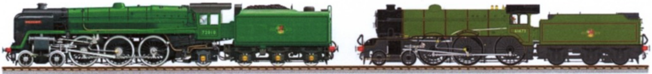
BR Standard Class 6 72010 'HENGIST'